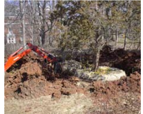
Moving trees at Acadia