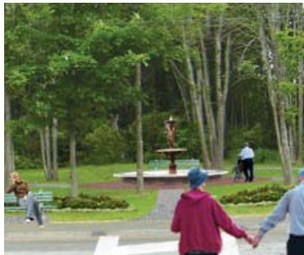
Fireman's Memorial Fountain