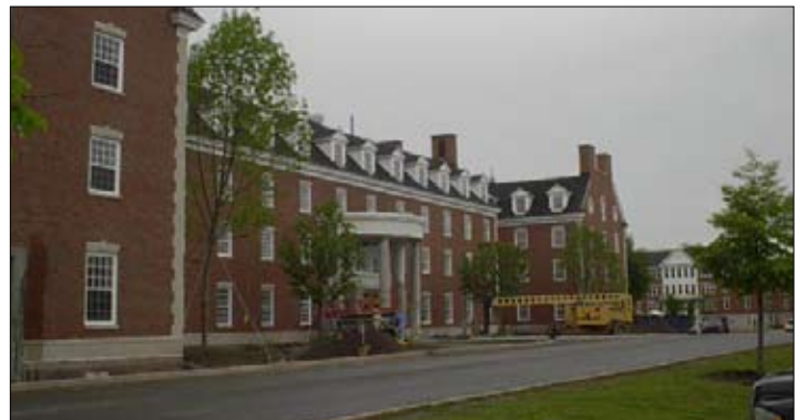
New Governor Place dormitory St. Fx